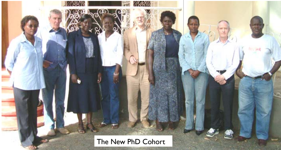
The New PhD Cohort